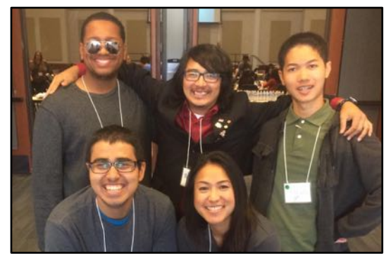
Some of our Rotaractors enjoying themselves at the Rotary Interact One Day Training!

(above) CH Rotaractors after a night of bowling at SDSU's Aztec Lanes.