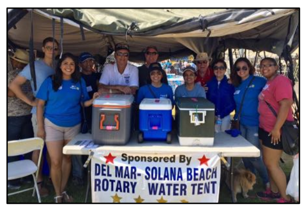
CHR members participated at Veterans Village of San Diego Stand Down event.